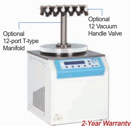
I. 3Lit/day Freeze Dryer “FD-8”

※ The Figure; Installation of Optional 12-port T-type Manifold and 12 Vacuum Handle Valve