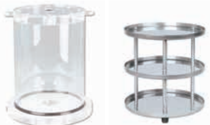
(2)-a-b 8-port Round-type Acrylic Dry Chamber (2)-c-d 3-stage SS Shelf