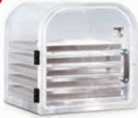
(3) Large Volume Square-type Acrylic Dry Chamber With 5-stage SS Shelf