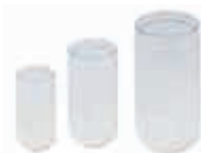
(11) Glass Flask