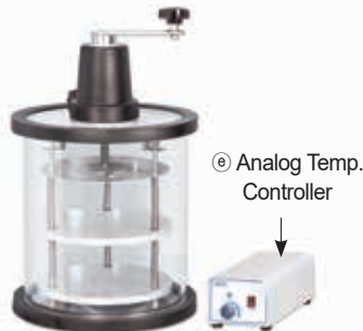
(4) Heated Stopping Acrylic Dry Chamber with 2-stage SS Shelf