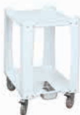
(13) 2-stage Table Cart