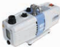
(12) Vacuum Pump