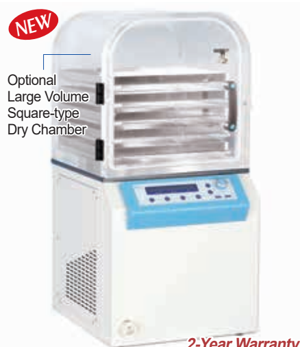
II. 6Lit/day Freeze Dryer “FD-16”

※ The Figure; Installation of Optional Large Volume Square-type Acrylic Dry Chamber