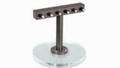
(1) 12-port T-type Manifold with 12 Silicon Stoppers

DH.Frd01062 (d) 3-stage Stainless-steel(SS) Shelf φ310×11mm, Total h225mm, for “UniFreez™ FD-16” model