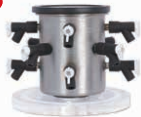
(5) 12-port SS Dry Chamber